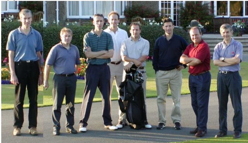
Participants at the 9 th Bad Etiquette Classic, Ganton (2002)