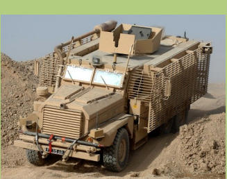
Toyota Tundra Rock Warrior bomb proof trim, gun turret, variable wipers, rapid golf bag deployment capability