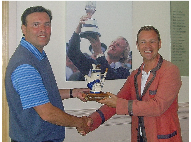
Jack Nicklaus joins the presentation party but gets distracted recalling how in 1978 he had his name engraved on the trophy in a larger font than rival Tom Watson the year before.