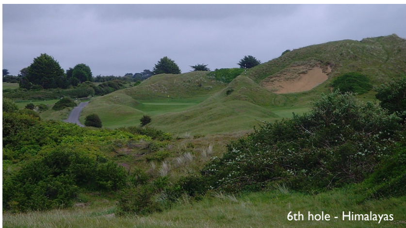
6th hole - Himalayas