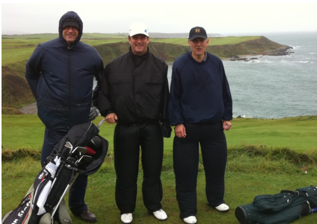
Nefyn & District survivors