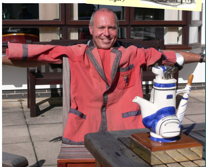
The Bad Etiquette Classic's famous Tea Pot and Pink Jacket are displayed along with the severed head of last year's Champion (a new custom) ahead of the 17th BEC prize ceremony