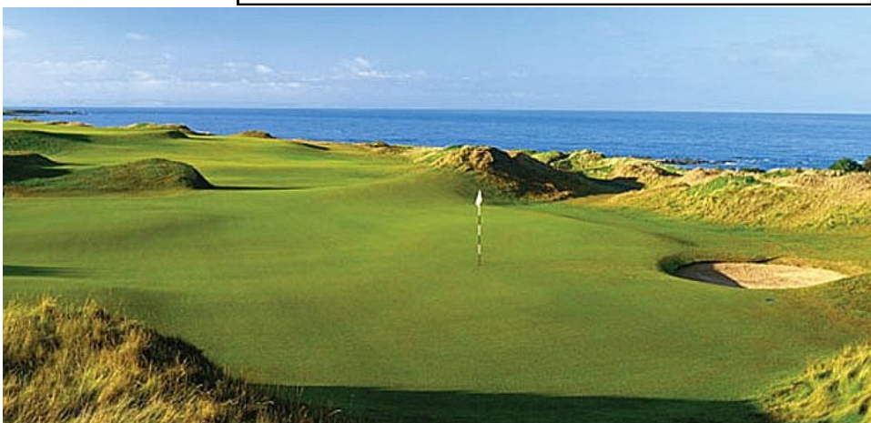
'Tassie', Kingsbarns' 5th hole 370yds (par 4)