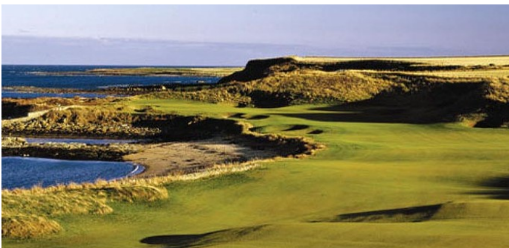
'Orrdeal', Kingsbarns' 12 th hole - 566yds (par5)

And what a golfing fest it was! Another 245,168 yds covered, another 3,747 random impacts tested and another 720 dimpled chromospheres holed. Yes, the 15th BEC was once again a triumph for man over matter.